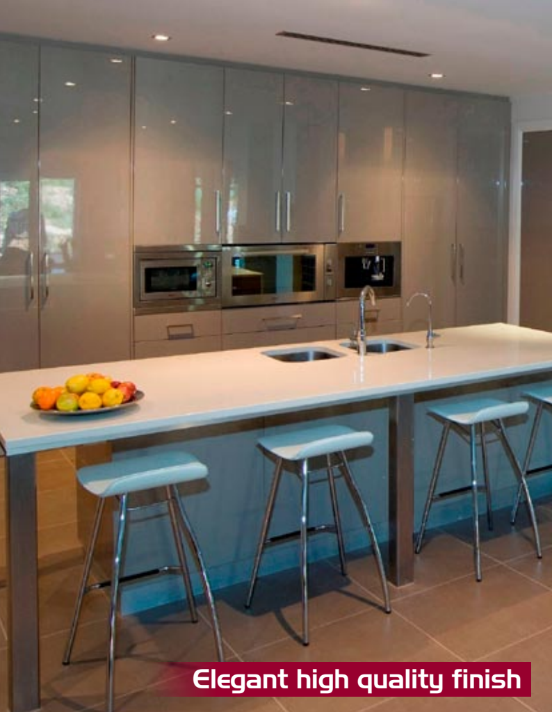
Elegant high quality finish