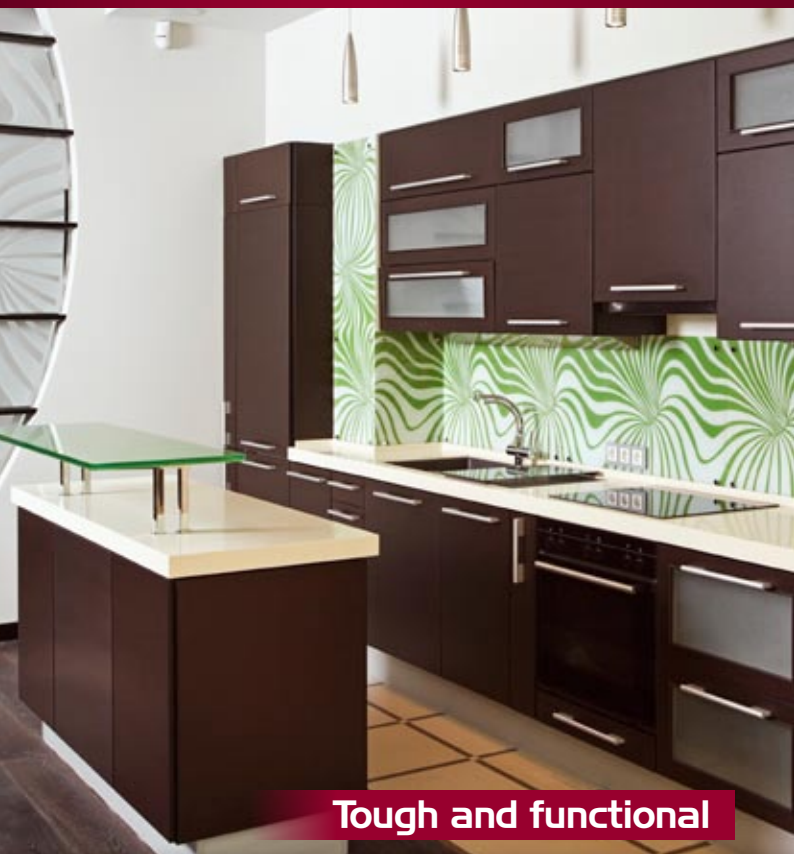
Tough and functional