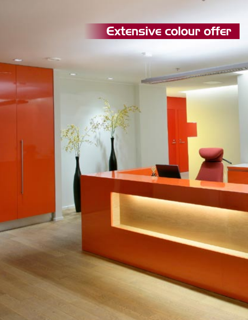
Extensive colour offer